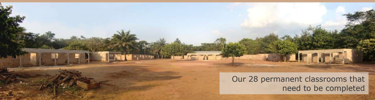
Our 28 permanent classrooms that need to be completed