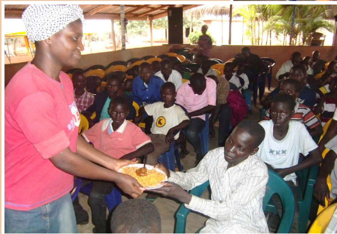
Sharing food for the children who just arrived