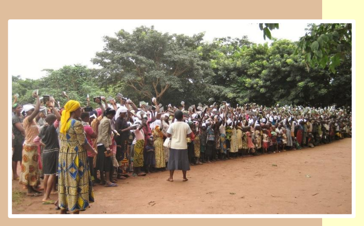
The children are happy about the donated new bibles.