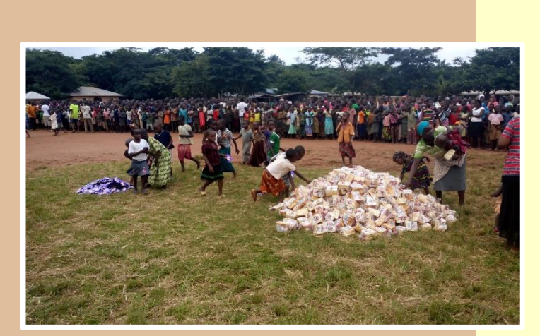
Giving out bread for all the children.

With great joy we also received about 300 children in January from the northwest of the country.